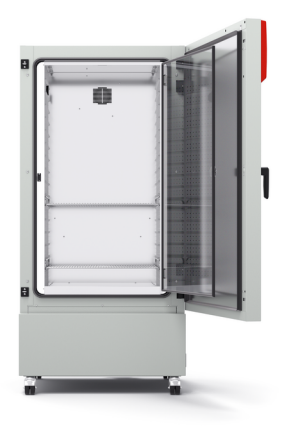
Model KB ECO 400