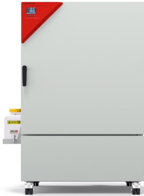
Model KBF-S ECO 240