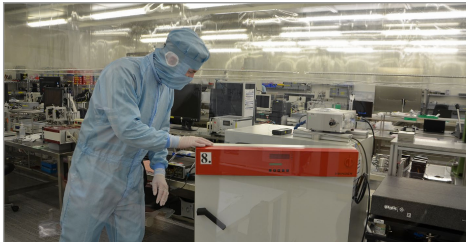
› BINDER chambers are also used for work in the clean room.

To do this, the company uses equipment such as dynamic climate chambers by BINDER, MKFs in the size 240. Stefan Vogtel says: “It is a great oven. It does exactly what it is supposed to and is 100% reliable.” Some background information: the hard drive motors no longer have any ball bearings but are equipped with fluid dynamic bearings (FDB) instead. They are tested between roughly minus ten and +100°C and at 85% relative humidity. And the MKF 240 masters all of this with ease. The dynamic climate chamber is one of the most popular ovens in the department. Vogtel adds: “Nowadays, tests are becoming increasingly specific, which means that the BINDER chambers we use have to meet stricter or changing requirements. For instance, the company can’t really manage without access ports these days, which are mainly implemented by BINDER INDIVIDUAL. An FED 720 drying chamber, for example, is ideally suited to this job. And Vogtel has not one but many versions of this type of chamber in use. They are located next to whole racks full of electronics, each of which always controls one