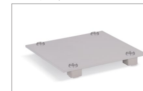
Stacking adapter with two C 170