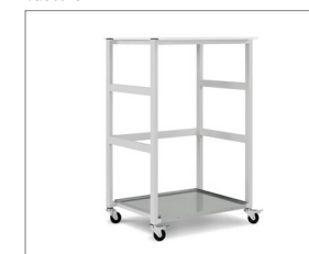
Stack on stacking frame with casters with model CB 170 und C 170