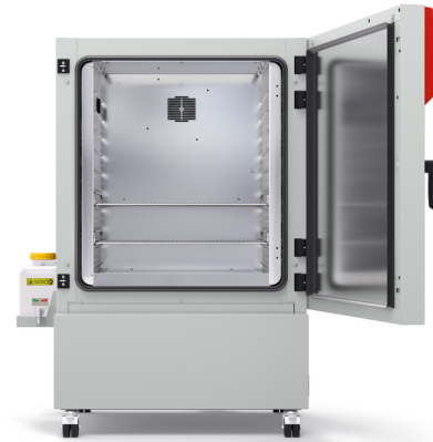
Model KBF-S ECO 240