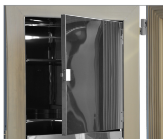
Foam-filled compartment doors with gasket