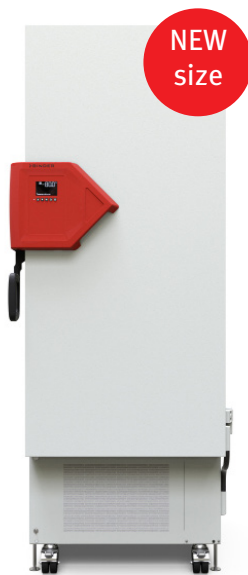
Model UFV 350

The BINDER ultra low temperature freezer ensures the safe storage of samples at -90 °C. It combines outstanding environmental friendliness with low energy consumption, convenient operation and an individual safety concept.