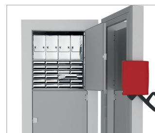
Selection of racks and boxes