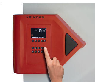
Door access system