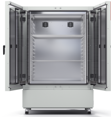
Model KB ECO 720