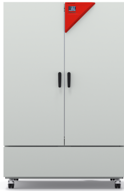
Model KB ECO 720