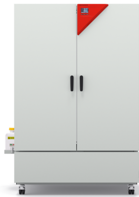
Model KBF-S ECO 1020