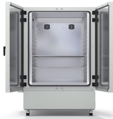
Model KBF-S ECO 1020