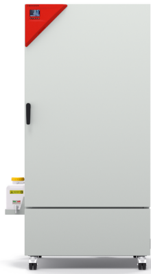
Model KBF-S ECO 400