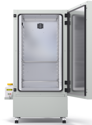
Model KBF-S ECO 400