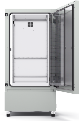
Model KB ECO 400