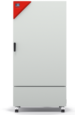
Model KB ECO 400