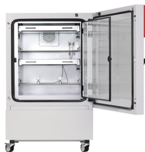
Constant climate chamber KBF LQC