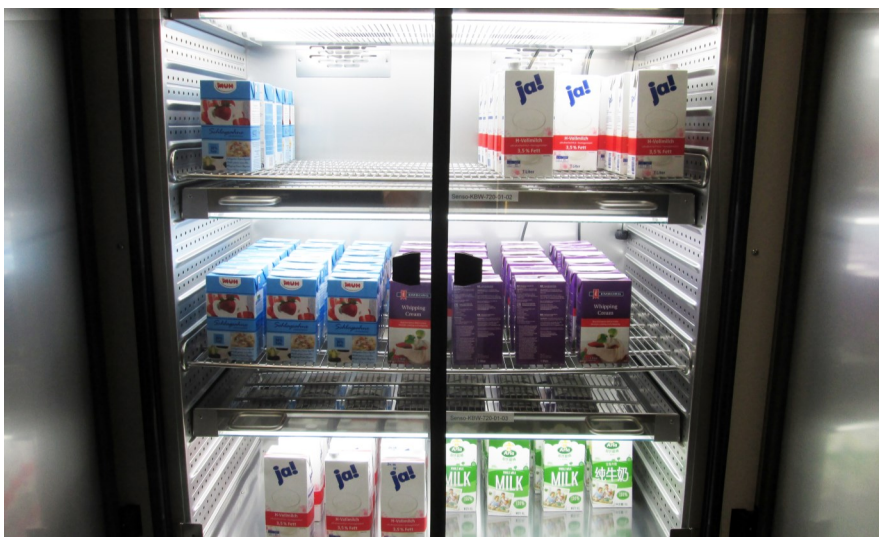
▲ Testing long-life and fresh milk and dairy products