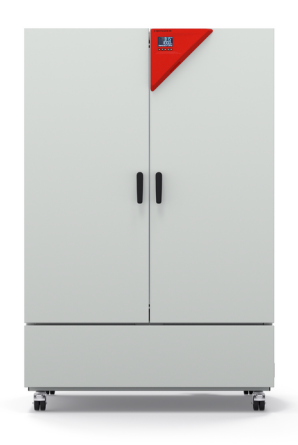
Model KB ECO 720