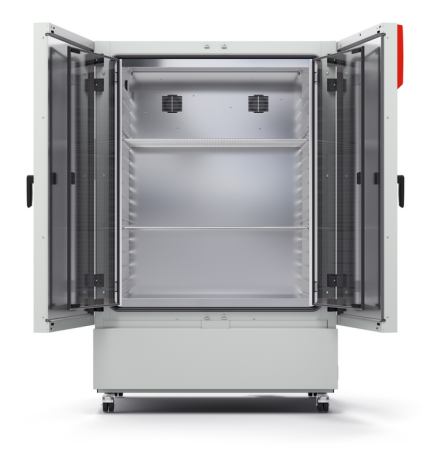
Model KB ECO 720