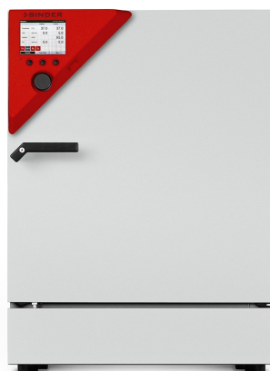
▲ CO 2 incubator CB 160